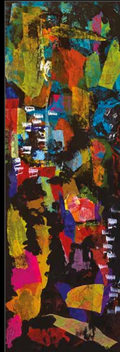
Black Myriad 120/40 cm