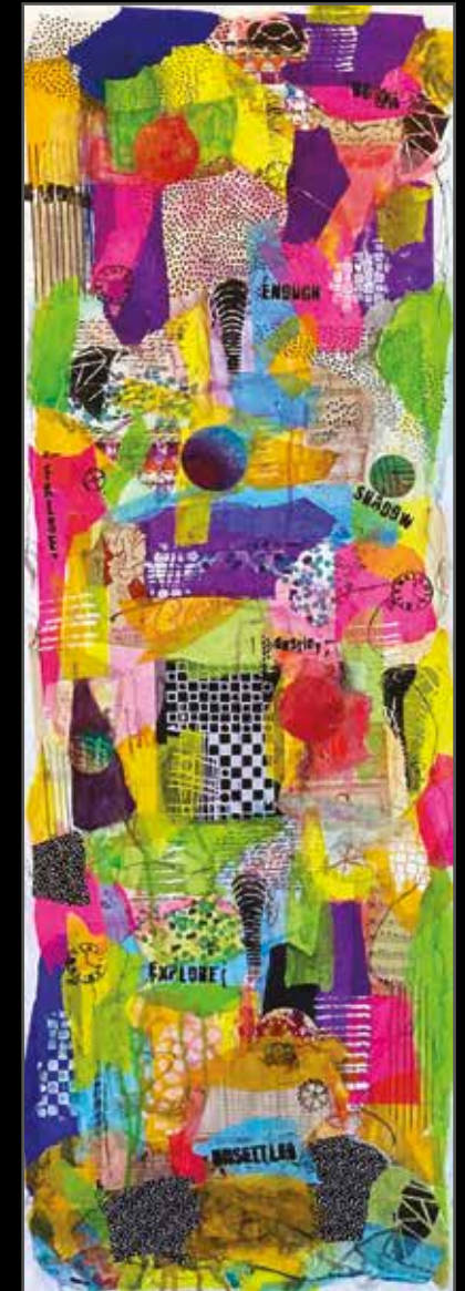
White Myriad 120/40 cm