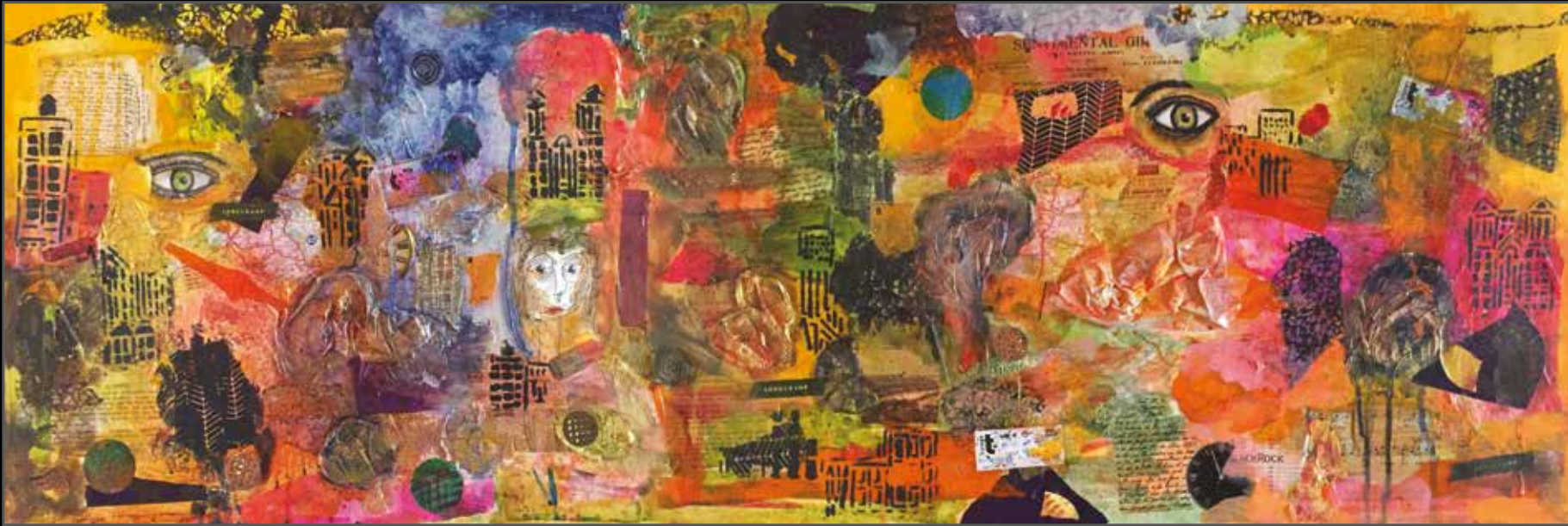
Trip down Memory Lane Canvas 120/40 cm

The Narratives are a series of mixed media art compositions, that tell a story of events, experiences and emotions, true or imaginary. The viewer is free to make his own interpretation of what he sees and which emotions are being triggered when observing the artwork.