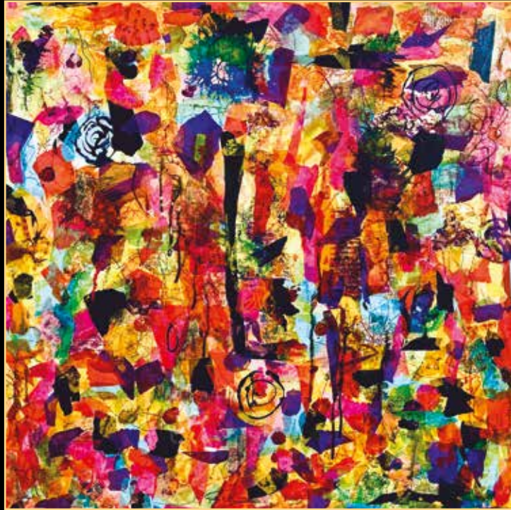
Myriad 03 90/90 cm