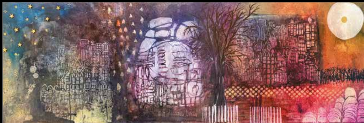
Doomsday Survival Canvas 120/40 cm