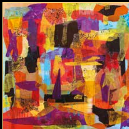
Myriad 02 80/80 cm